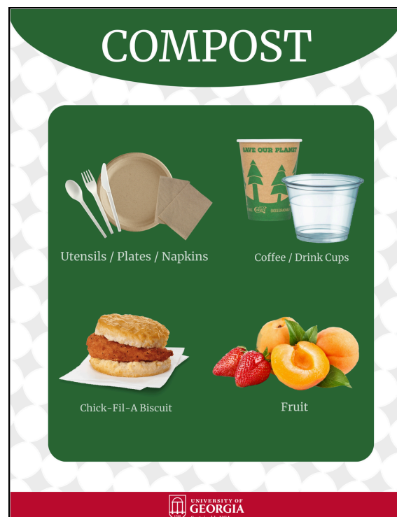
Sample Event Sign