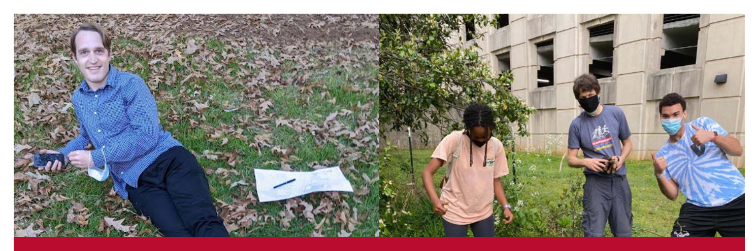
Left: A LAND 4350 Student selects a site to design a rain garden with pollinator-friendly plants.

Right: Invasive species student group related to EDES 7350 and HIPR 6440 remove early spring annuals Youngia japonica and Youngia thunbergiana