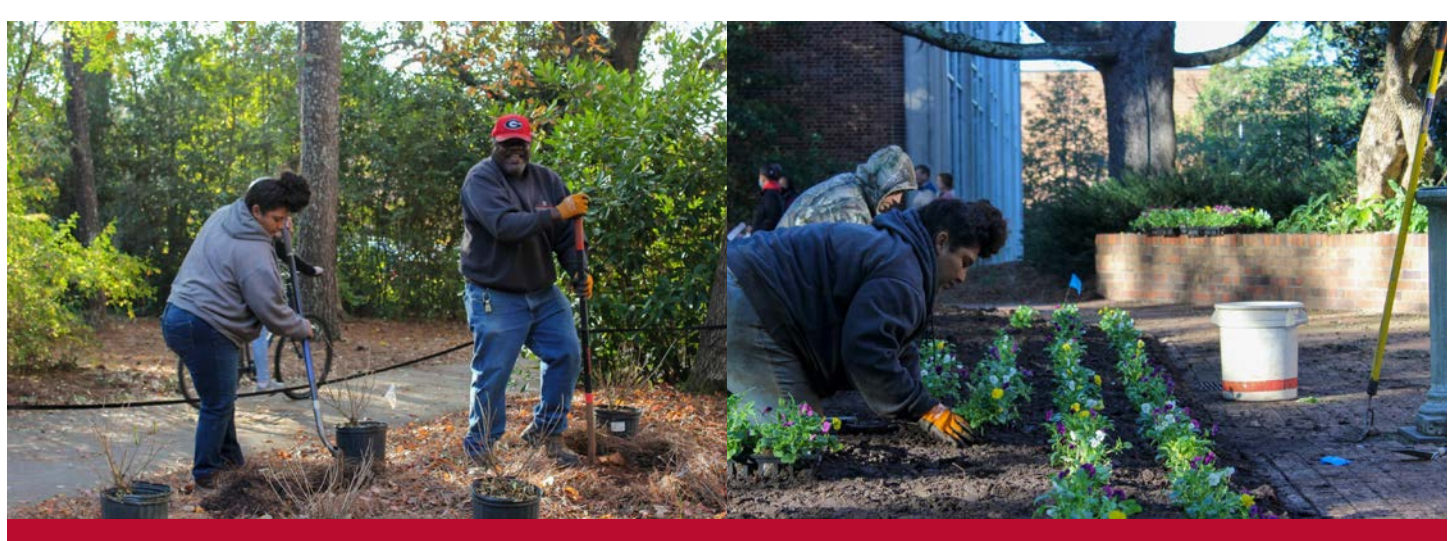
The UGA Grounds Department Horticulture Crew plants drought and shade-tolerant annuals.

Properly planted and well-adapted turf and ornamentals are chosen for their pest resistance and their ability to thrive in the locations selected for them. Irrigation is tested periodically to ensure there are no leaks, breaks, and to make sure they are not covering hardscapes. Sufficient organic mulch is applied to ensure good soil moisture and adequate weed control. Additionally, effort is made to leave leaf fall as mulch where practical. All remaining leaf and limb debris is collected, composted, and then re-applied on campus. Using these management tactics, the University of Georgia keeps a healthy and well-kept landscape.