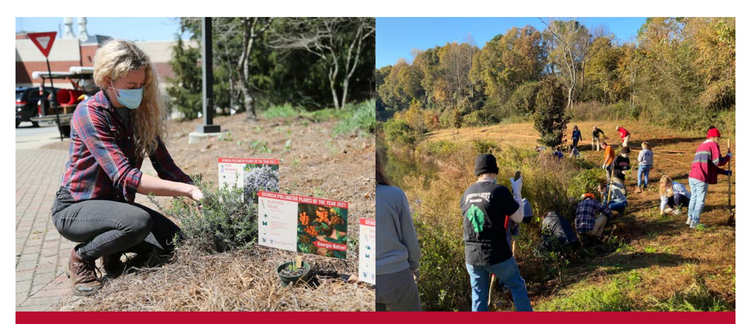
Left: Lauren Muller, State Botanical Garden of Georgia Conservation Coordinator, installs garden beds filled with native pollinator plants on East Campus Road.

Right: Volunteers clear weeds from an area surrounding Lake Herrick and begin planting milkweed plants.