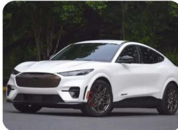
FORD MUSTANG MACH E (EV)