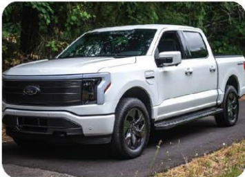
FORD F-150 LIGHTNING (EV)