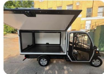
CLUB CAR EXTENDED CHASSIS (EV)